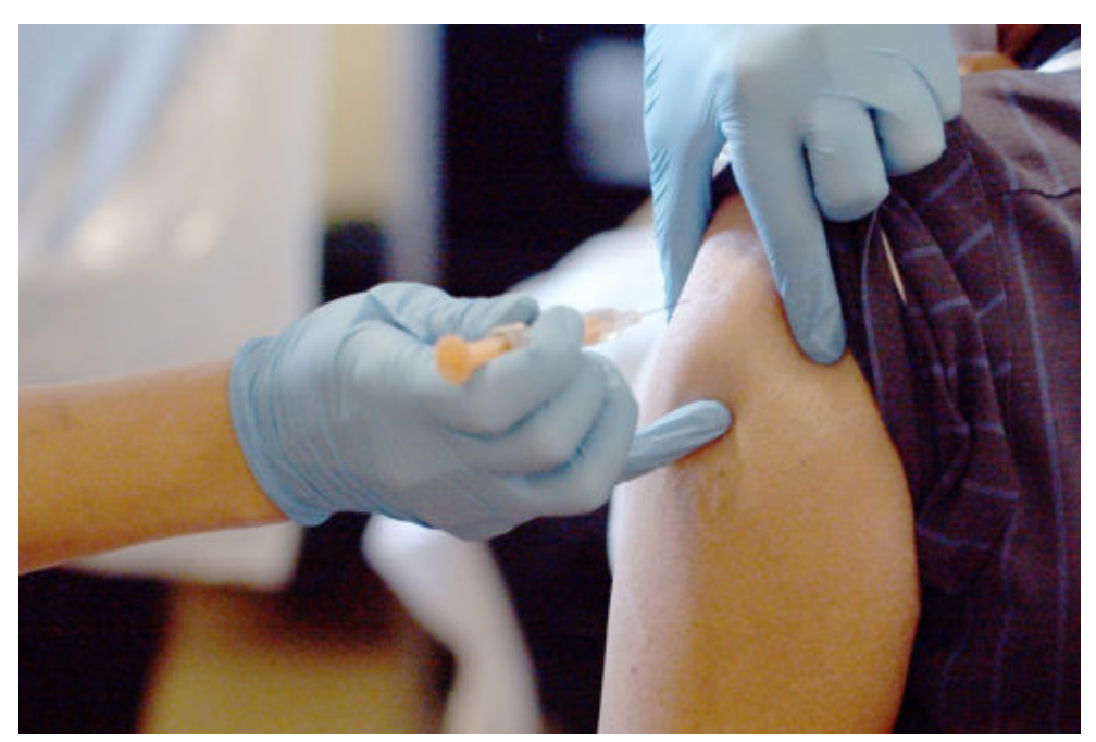
"Vaccinated Healthcare staff are much less likely to pass any infection to their friends and family and to the vulnerable people they care for"

Contact the Home by calling 01483 488 917 or email Princess.Christian@Nellsar.com